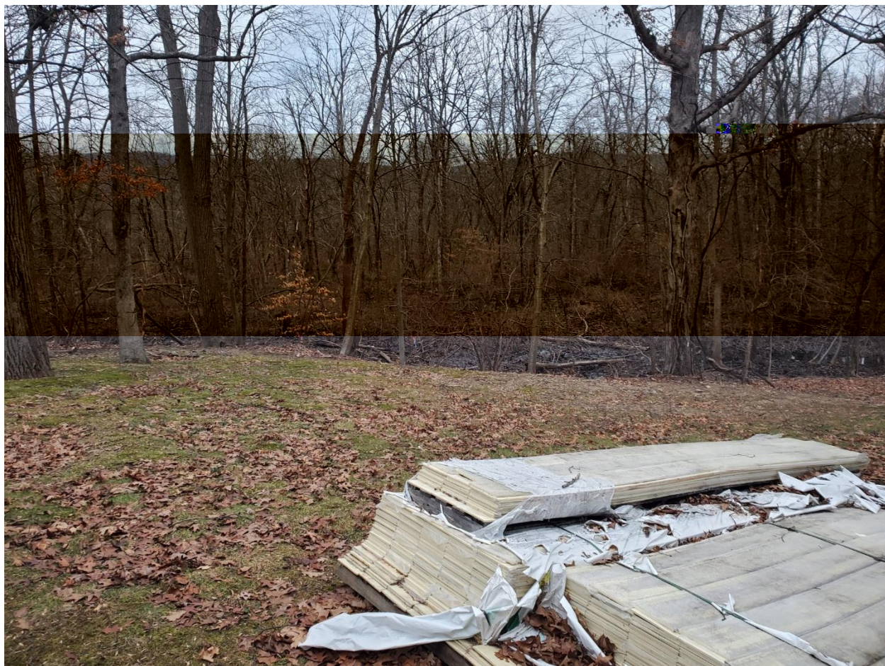
Looking northwest towards wetlands