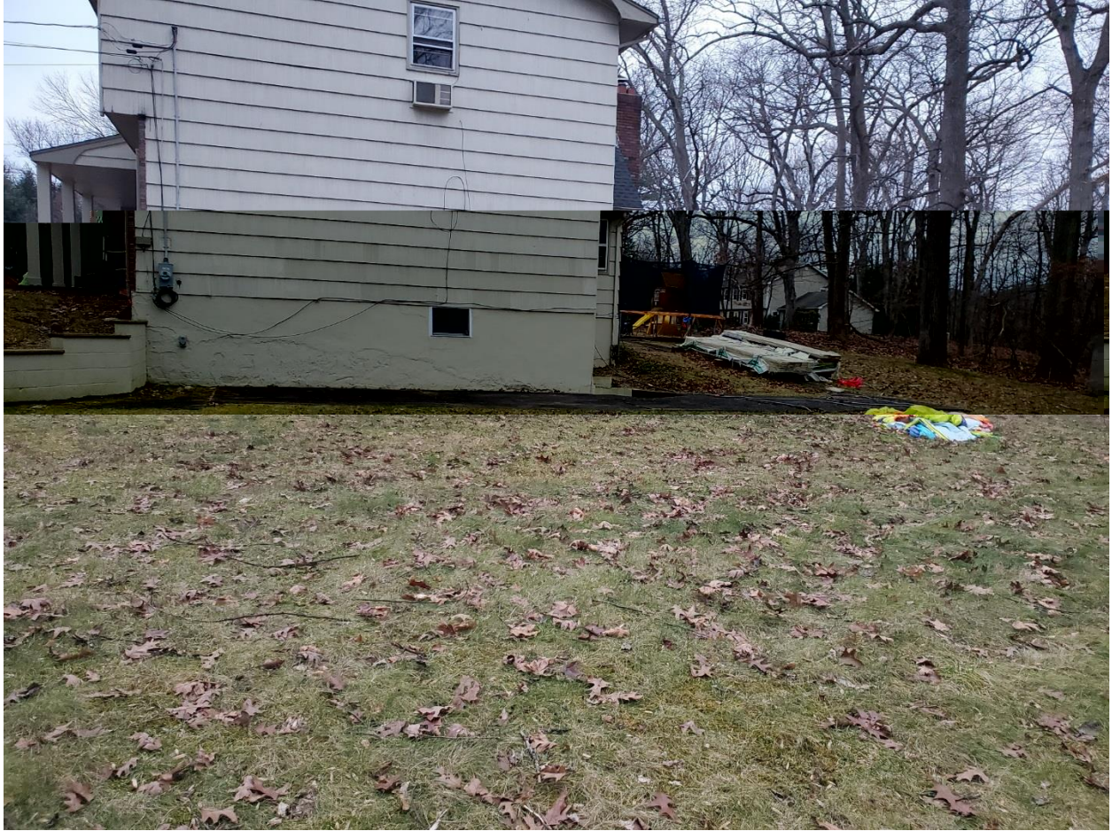
Looking southwest where pool will be